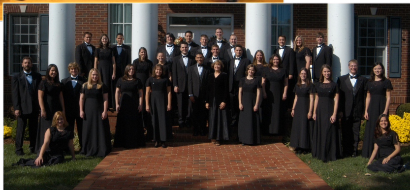
Top, the String Chamber Ensemble. Above, the University Chorale