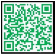
Sexual Misconduct Reporting Form

To file a report or complaint of sexual misconduct, contact the Title IX Coordinator, whose contact information is listed above, or use this QR code to complete an online reporting form: