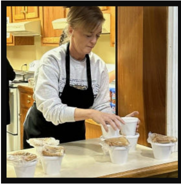
Helping Hands At Work