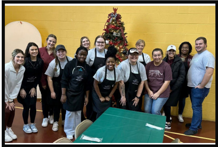
Social Work Club at the Local Soup Kitchen